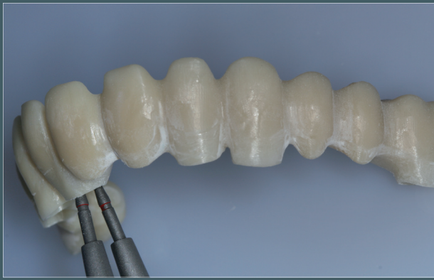
Corundum sand-blast conditioning (activation)