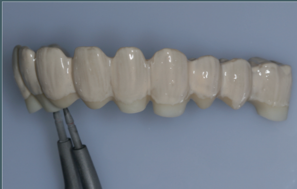
Opaquer / Zirkonbonder application