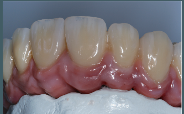
Veneer and finish with visio.lign