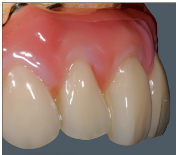
Custom gingival characterization with Crea.Lign Composites