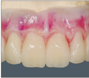
Custom wax-up with Novo.Lign Veneers