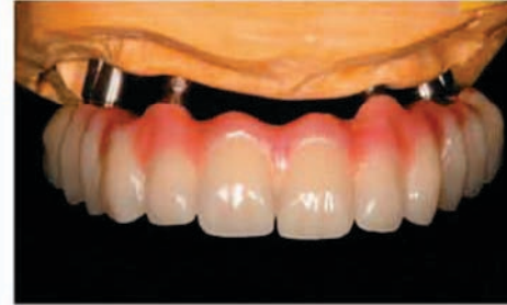
Final restoration frontal view