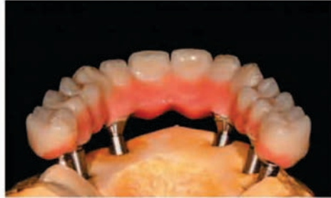
Final restoration with pink veneering