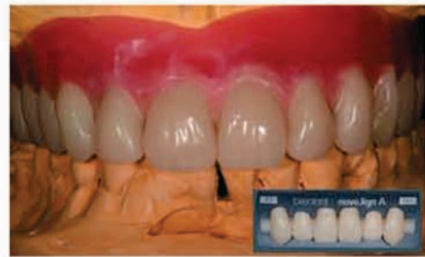
Wax-up with anterior and posterior veneers

15 patients received implant supported restorations using these veneers (visio.lign, Bredent, Germany). There was one full arch restoration in the maxilla, two full arch restorations in the mandibula, two FPDs (3 units) in the anterior maxilla and ten FPDs (3 units) in the lateral mandibula. Eight FPDs zirconia frameworks were used. The other restorations were made with non precious metal frameworks. All patients had a 3 month control up to two years.