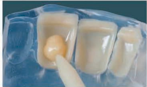
Fixation with combo.lign (dual-hardening)