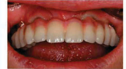
Restoration with temporary cement