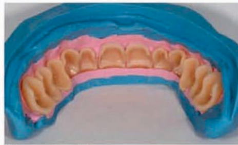
Silicone key with veneers