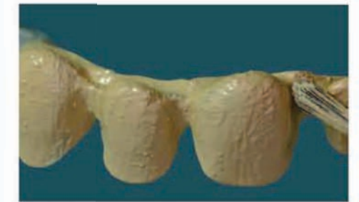
Metal framework with opaquer