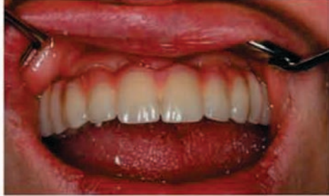
After 2 years in function