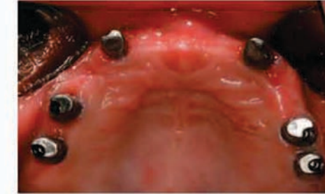
Intraoral view with 6 Atlantis abutments